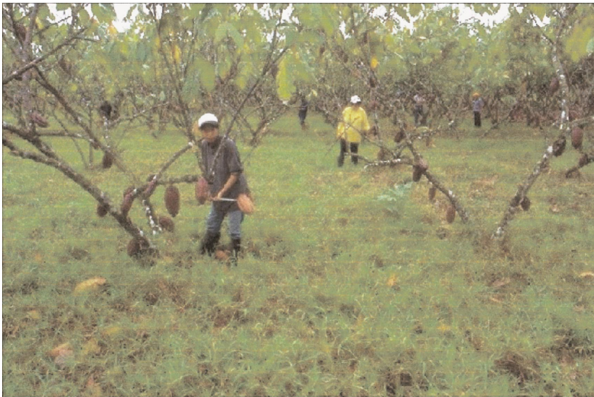
Fig. 3. Harvesting cacao in full sun. Note the dense ground weeds.

Traditional aromatic varieties are common and are generally unirrigated. Farmers use some chemical fertilizer on traditional varieties, but the only farmers who fertilize heavily are those with the modern variety CCN51. Epiphytes (air weeds) have to be cleaned off by hand, but are more common in traditional, shaded cacao. Full-sun cacao, especially CCN51, encourages ground weeds and farmers tend to use more herbicides with it. Farmers use fungicides and insecticides only sporadically (see Table III).