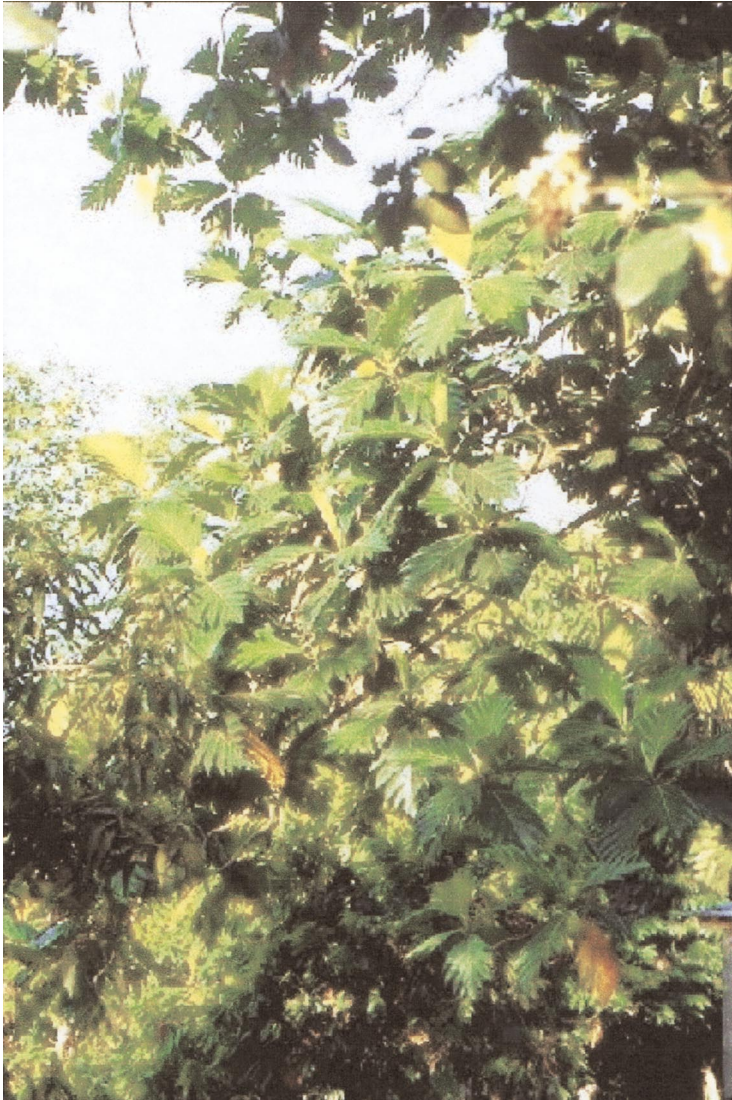
Fig. 5. Breadfruit trees cast dense shade, and the heavy leaves lodge in cacao branches.

with farmers, activists will need to be aware that not all trees intercropped with cacao are for shade, and that many are domesticated or at least managed, and are not all wild forest trees.