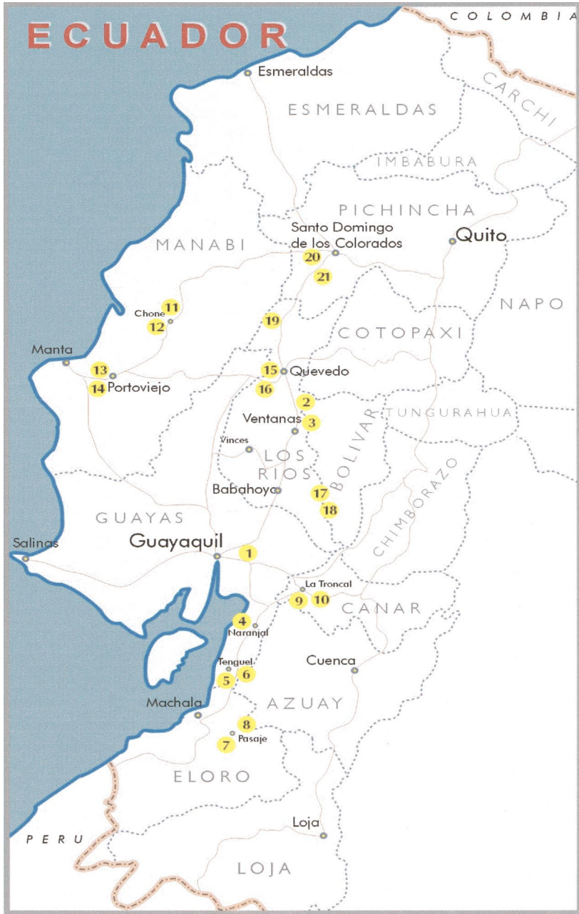
Fig. 1. Location of study sites in Coastal Ecuador.