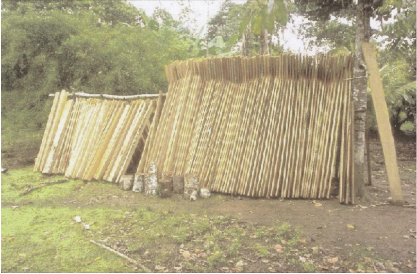
Fig. 4. Laurel timber drying next to a cacao grove.

plants. In some groves, farmers plant coffee as an understory to cacao, so the cacao is actually the shade tree for the coffee.